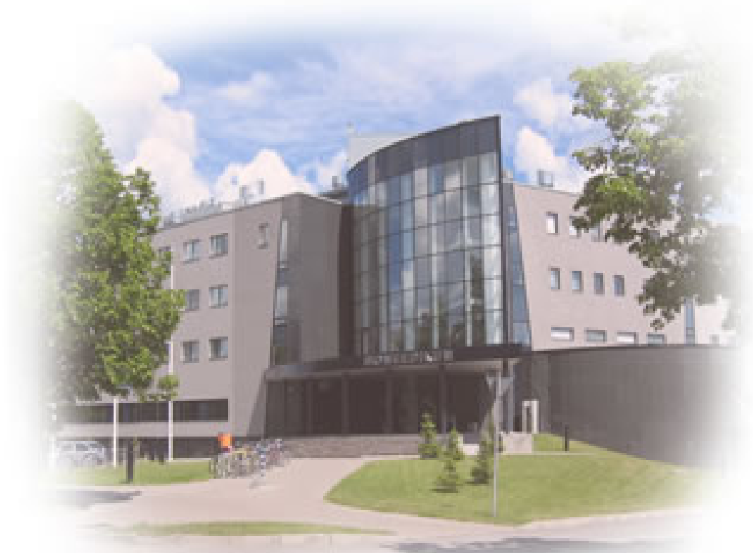
Biomedicum 1999 University of Tartu