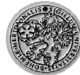
University of South Bohemia